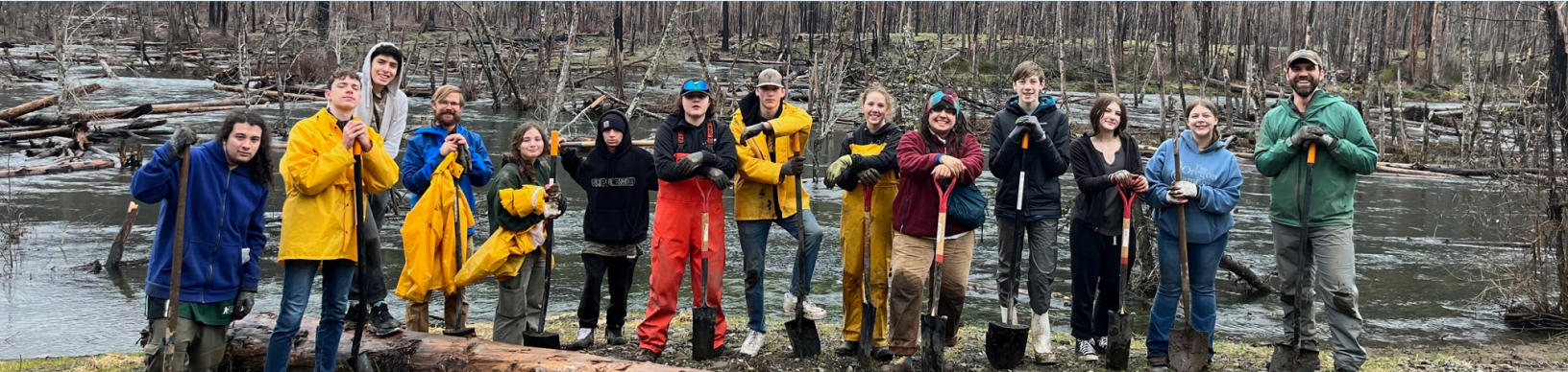
WATERS Program at Finn Rock Reach

Springfield Utility Board Twin Rivers Charter School Upper Willamette Soil and Water Conservation District US Forest Service Willamalane Park & Recreation District Yogi Foundation 9Wood